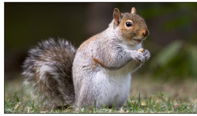
Thinking about nuts, or something much more sinister?